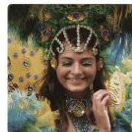
Rio de Vida