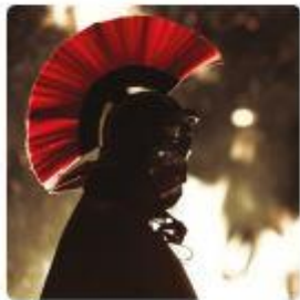
I Am Warrior!