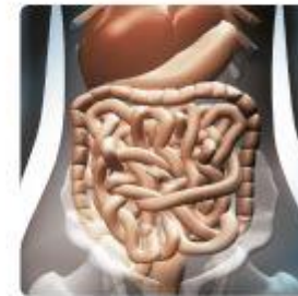
Burps, Bottoms and Bile