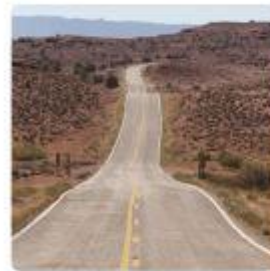
Road Trip USA!