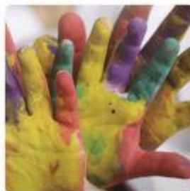
Muck, Mess and Mixtures