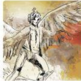
Gods and Mortals